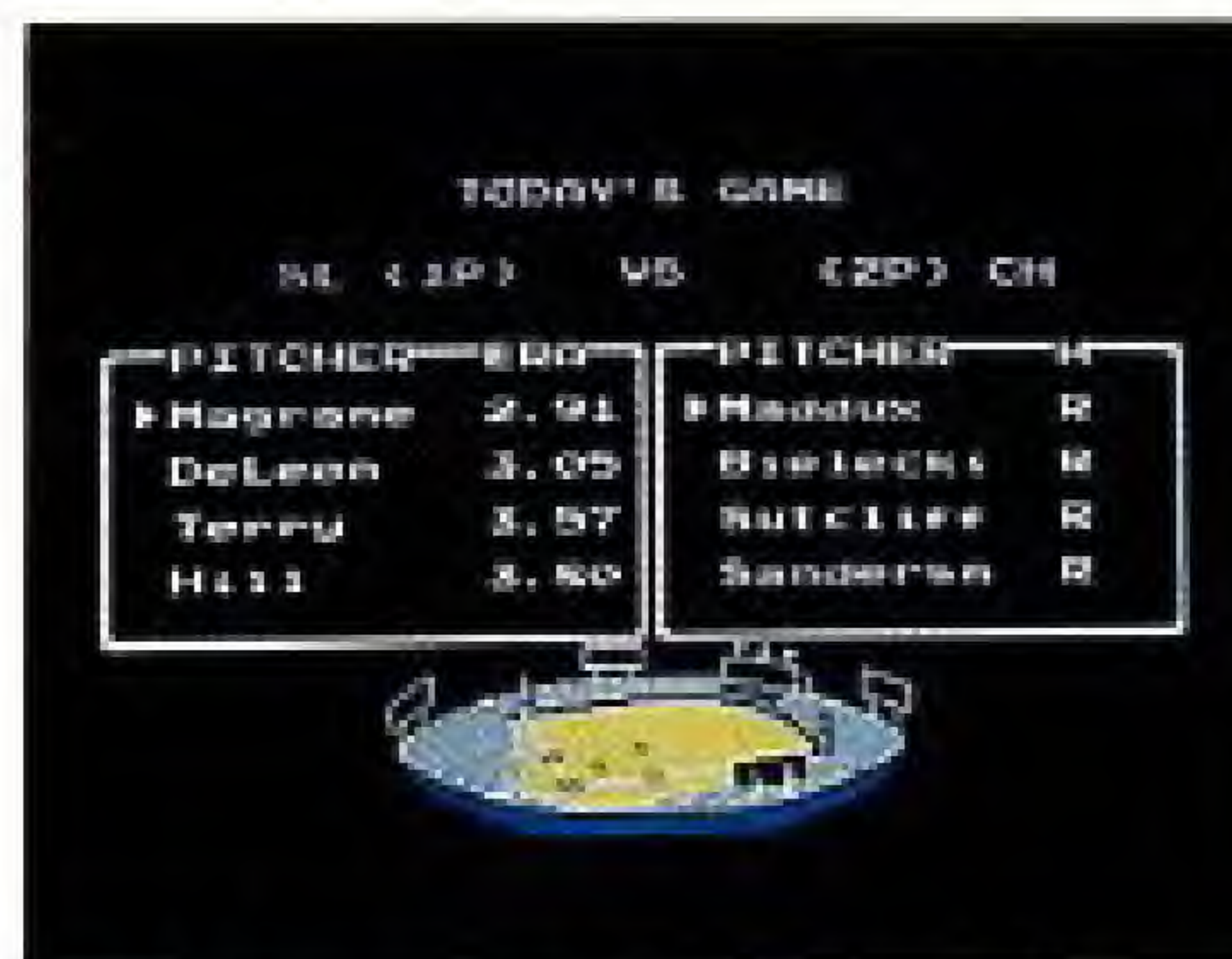
Select your starting pitcher.

Note: You may use up to 5 pitchers per game: 1 starter and 4 relievers or 2 starters and 3 relievers. The first 4 pitchers on your roster are the starters. A starting pitcher may only appear in every other game of a series.